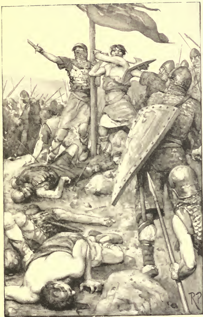
THE LAST STAND AT HASTINGS